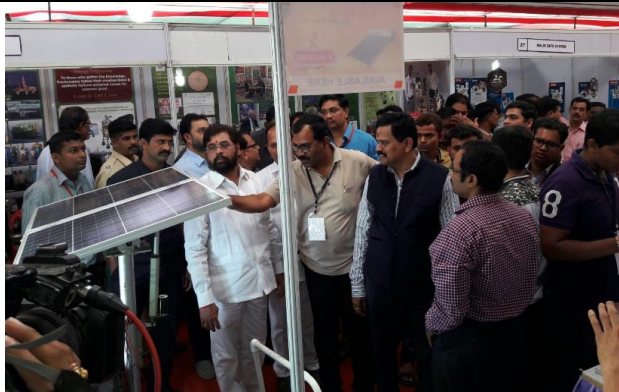
MSME Exhibition, Thane