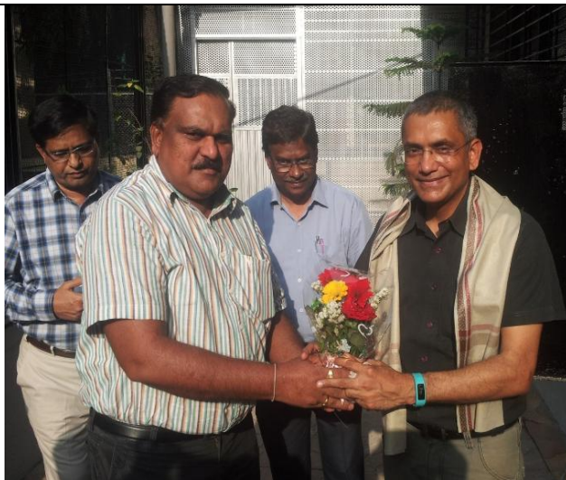
First Net Metered Solar Plant inaugurated by MSEDCCL Chief Engineer, Mumbai Zone