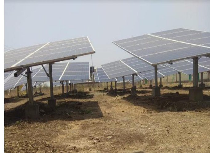
End User/Client: Mahabeej/Client