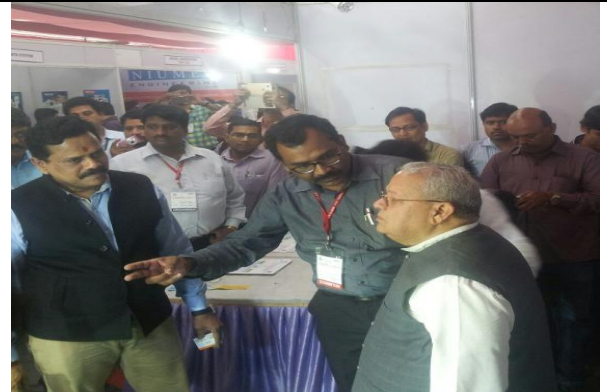
MSME Exhibition, Thane