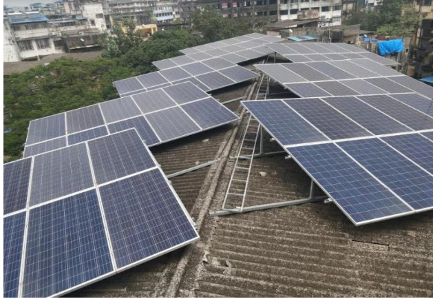
Gune Hospital, Panvel