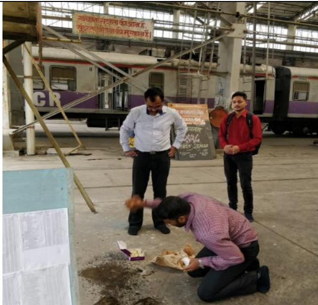
End User /Client: Central Railway/Datum Energy