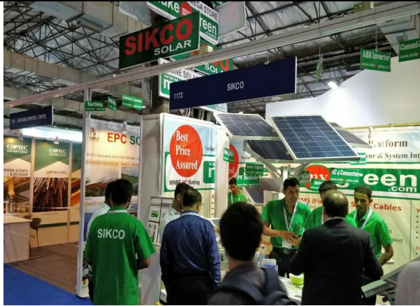
Inter Solar Exhibition, Mumbai