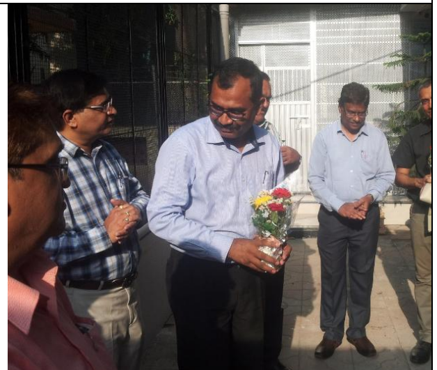
Facilitated by MSEDCCL