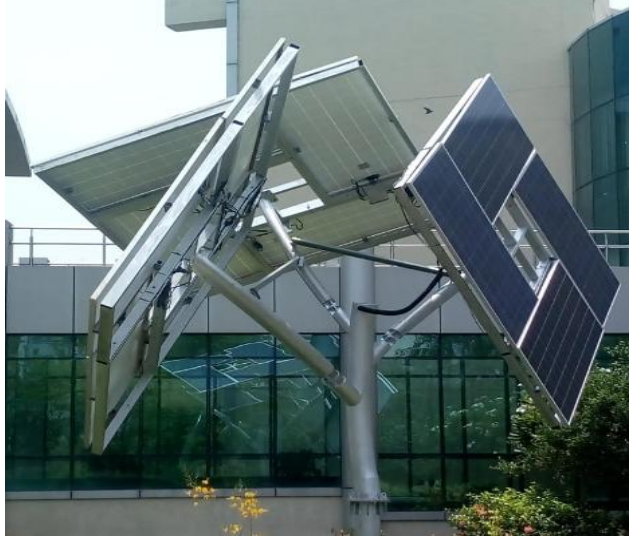
Solar Tree, Hyderabad